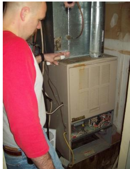
Don Shirk working on heat/air unit

Don's dedication and expertise has saved the camp many hundreds of dollars. For instance, he worked on this heat/air unit in the motel building to make it run much more efficiently.