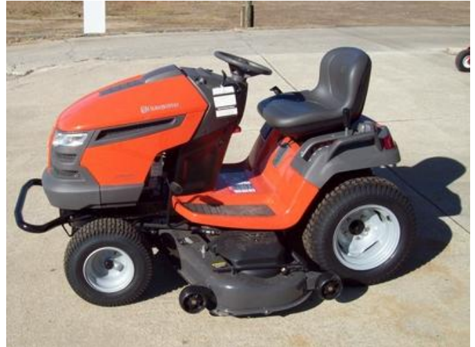
A Husqvarna mower on the dealer's lot

This model of Husqvarna mower seems to be built for the type of mowing on the camp grounds. With your donations, we hope to purchase this mower immediately.