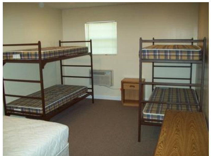
A second-floor family room in Heritage Hall