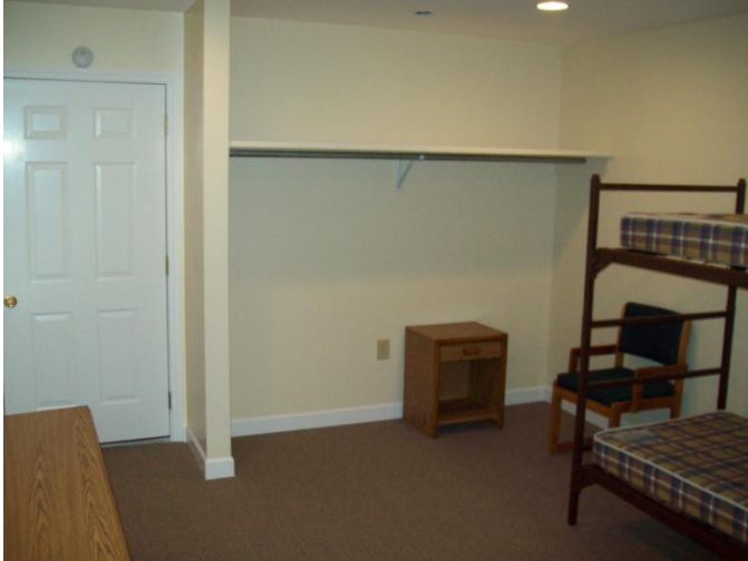
Another second-floor family room in Heritage Hall

Thank you for your support in completing 11 family rooms on the second floor of Heritage Hall. Most rooms are furnished with one double bed and two sets of bunk beds. Only six more rooms remain to be done! When all rooms on the second floor are completed, 100 people will be able to stay upstairs in Heritage Hall!