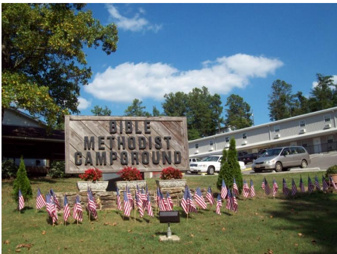
Entrance to the camp grounds

Thank you for your continued support for the ongoing ministry of the Alabama Bible Methodist Camp! For more than 70 years, God has been using its ministry in many ways to