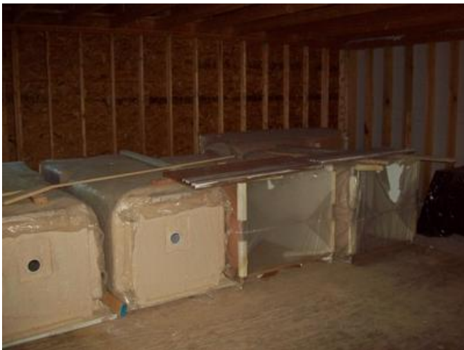
Shower units to be installed in second-floor rest rooms

The Camp Improvement Project for this year is to complete men's and ladies' restrooms on the second floor of Heritage Hall. This involves the installation of five showers, five commodes, and five lavatories in each restroom.