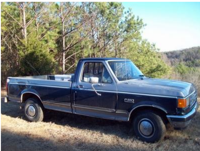
Present camp truck that needs to be replaced

The present camp truck is leaking oil in several places and needs to be replaced.