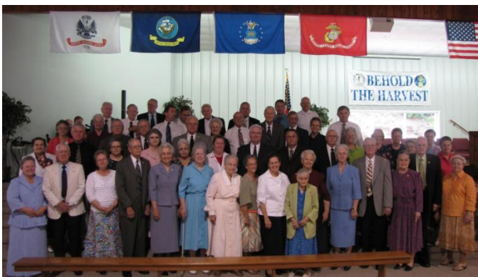
First-generation camp attendees

build closer relationships with Him and with one another. Only eternity will reveal the full extent of ministering to the needs of every generation.