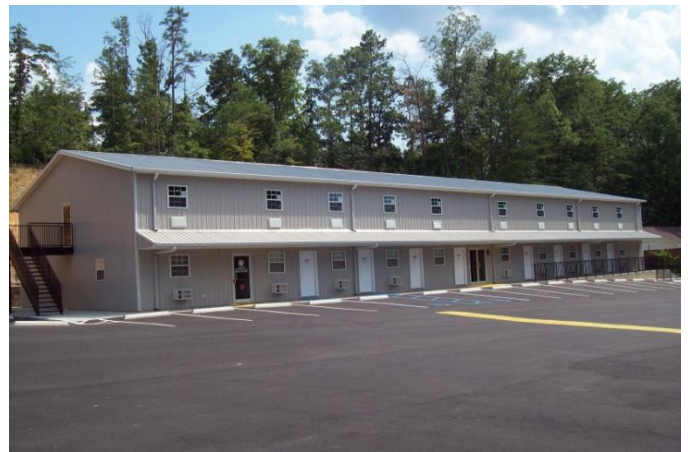
The front of Heritage Hall

To build Heritage Hall was a major undertaking, but with the help of God and people committed to “building for generations to come,” the vision became reality! Thank you to every person who had a part.