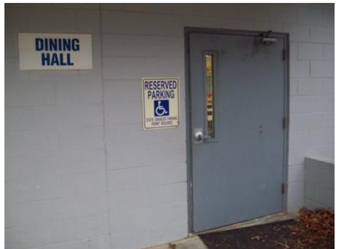
Present dining hall door that needs to be replaced