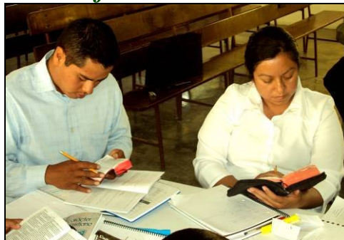
Pastors during class