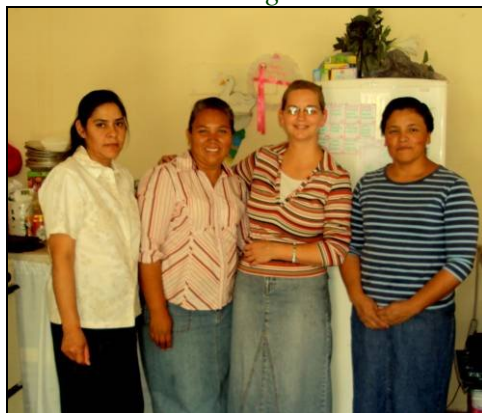
Helping the cooks in the kitchen