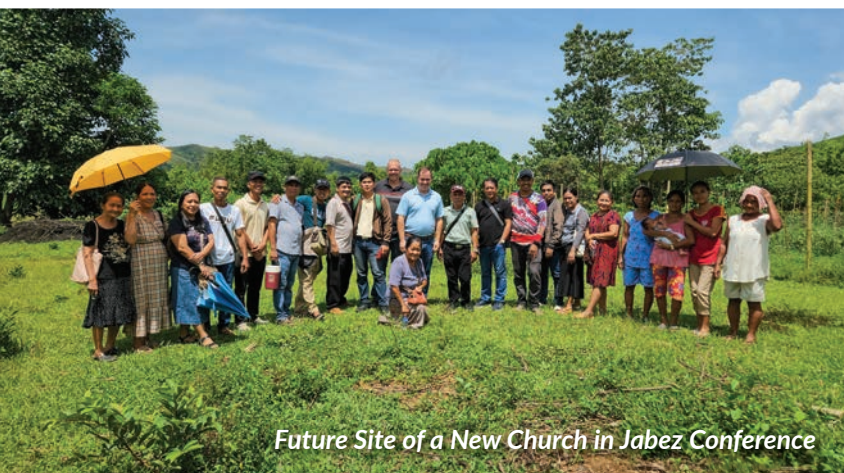
Future Site of a New Church in Jabez Conference