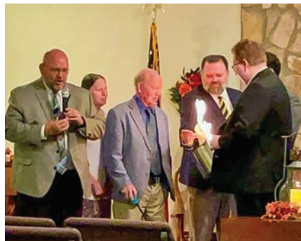
It was a great day in Graham, NC, as the church burned its mortgage—a joyful celebration of being completely debt-free!