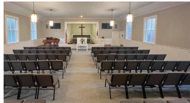
Brent Bible Methodist received a beautiful remodel—thanks to everyone who made it possible!