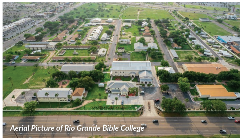
Aerial Picture of Rio Grande Bible College