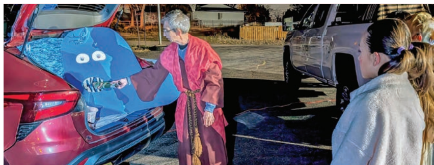
The church in Lakewood was able to reach people in the neighborhood through a Trunk or Treat.