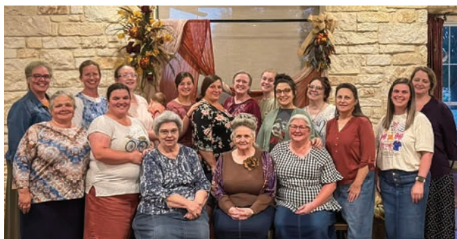
A good group of ladies attended the Southwest Ladies Retreat.