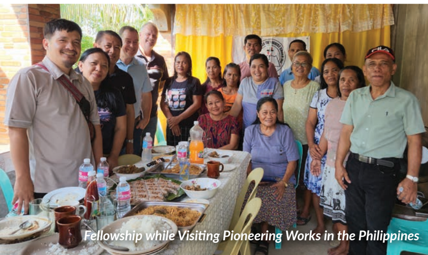
Fellowship while Visiting Pioneering Works in the Philippines