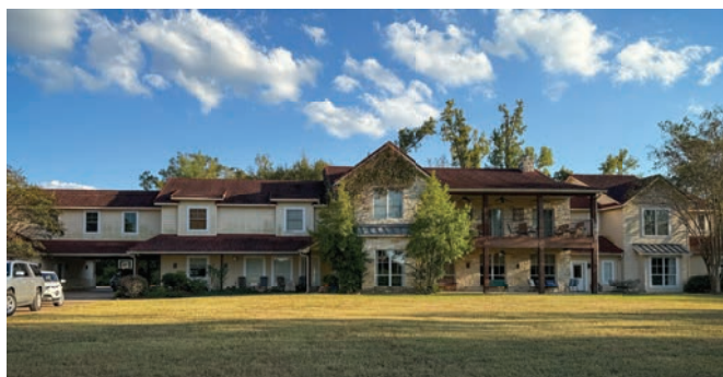
The Southwest Conference Ladies Retreat was held at Pure Hope Inn at Talco, TX.