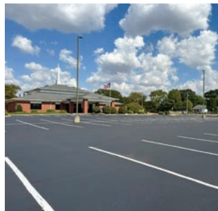
Findlay BMC partnered with area churches and Hancock Co. Right to Life for the Life Chain event. They also resealed and striped their parking lot—beautiful!

The musicians at West Mecca led a wonderful Conference Rally Sunday, with great worship and fellowship enjoyed by all!