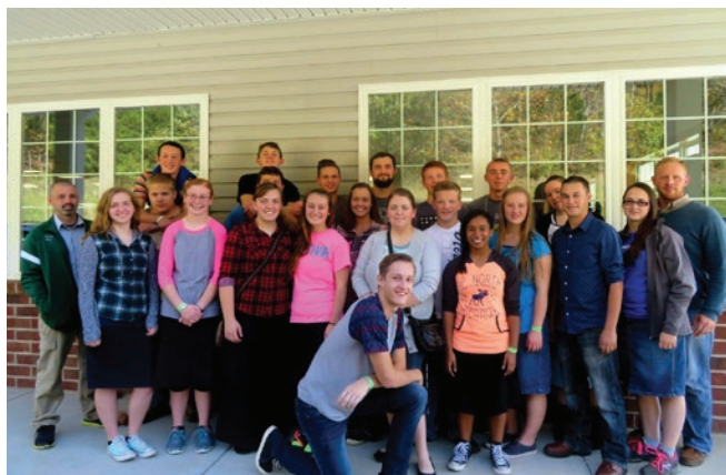
Evart Youth Group at Youth Challenge