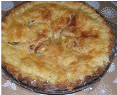
One of the pies

"Prayer, Praise and Pie at the Parsonage" happens once a month (usually the 3rd Wednesday). We move our midweek prayer meeting from the church (Dawn