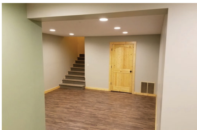
A full basement remodeling was finished at the Evart Bible Methodist Church in time for them to host the ACE Junior Convention.