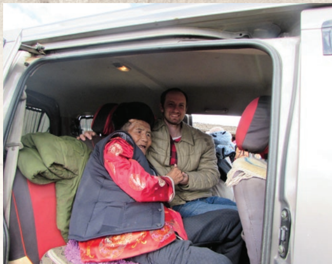
A Buddhist in his 90's who recently became a Christian

We recently had an encouraging trip to Shangrila. A former monk (became like-minded) met with us ("T" family) a couple times and took us to a village. We met this like-minded man in his nineties. He became a believer about ten years ago. It was encouraging to think that people so late in life can still find forgiveness and new life! We should pray that many find Christ through the witness of his twilight years.