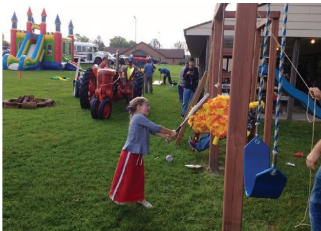
Fun for all