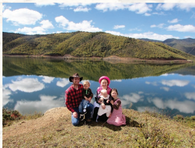
The "T" family on a recent trip to a part of the Asia Highlands with few believers

We recently had an encouraging trip to Shangrila. A former monk (became like-minded) met with us ("T" family) a couple times and took us to a village. We met this like-minded man in his nineties. He became a believer about ten years ago. It was encouraging to think that people so late in life can still find forgiveness and new life! We should pray that many find Christ through the witness of his twilight years.