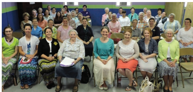
WMS ladies that raised over $200,000 dollars