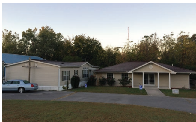
Wesley Bible Church - Crossville, TN