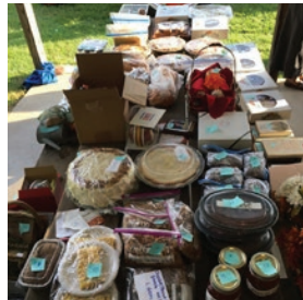
Plenty auction items

The fall picnic and youth auction was well attended at the Franklin church. $1500 was raised for Youth Ministries in the auction.