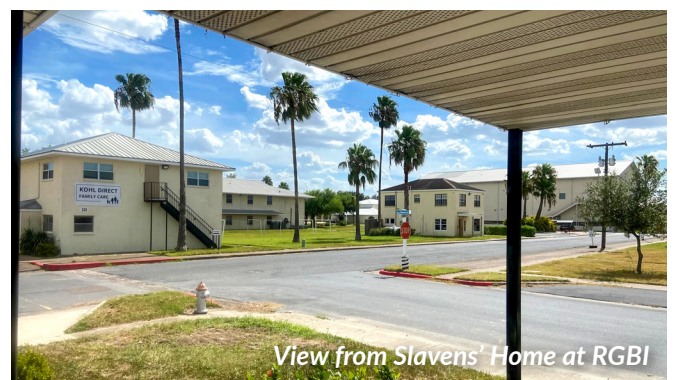
View from Slavens' Home at RGBI