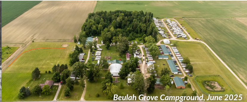
Beulah Grove Campground, June 2025

Churches, becoming two distinct regional conferences. Since then, in addition to the Heartland and Southern Conferences, two other regional conferences have joined the larger connection—the Great Lakes Conference (1994) and the Southwest Conference (2018).