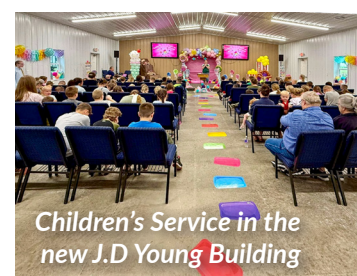
Children's Service in the new J.D Young Building