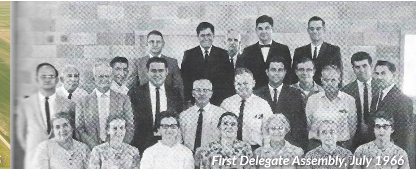
First Delegate Assembly, July 1966