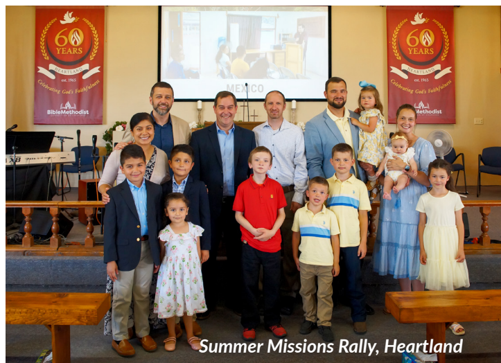
Summer Missions Rally, Heartland