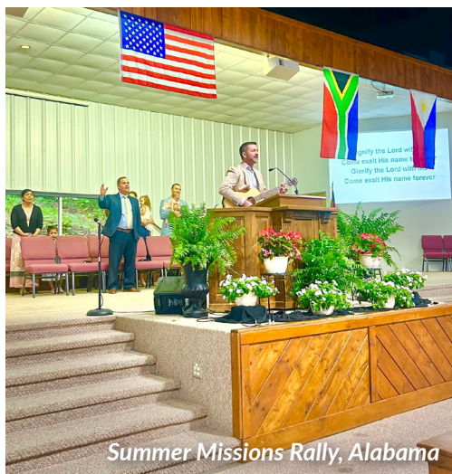
Summer Missions Rally, Alabama