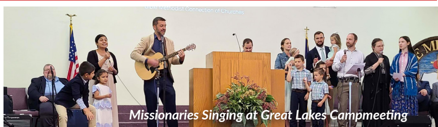
Missionaries Singing at Great Lakes Campmeeting