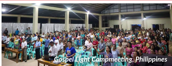
Gospel Light Campmeeting, Philippines