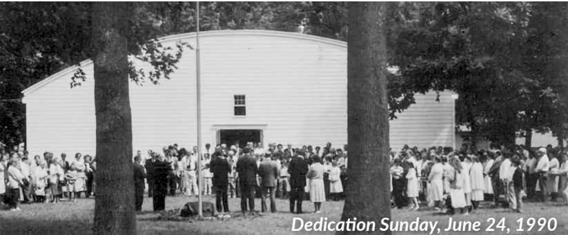
Dedication Sunday, June 24, 1990