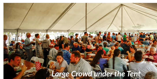
Large Crowd under the Tent