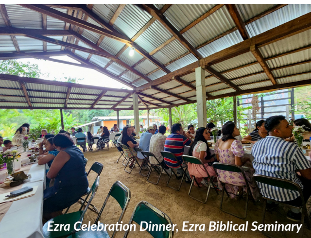
Ezra Celebration Dinner, Ezra Biblical Seminary