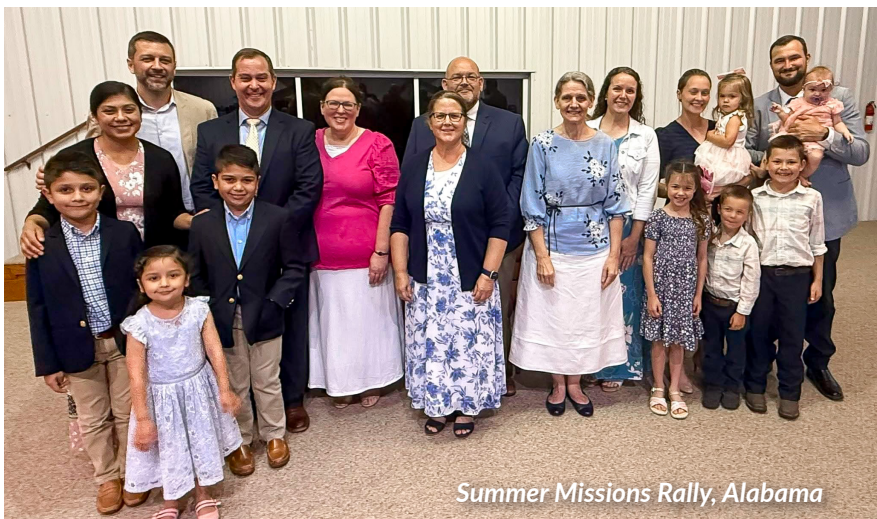
Summer Missions Rally, Alabama