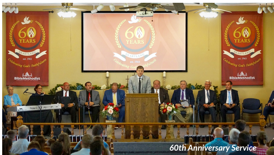
60th Anniversary Service

Saturday was a special day of celebration, including a pig roast, golf cart parade, and an evening service dedicated to thanking God for His faithfulness. The offering received was one of the largest outpourings of giving in our 60-year history. Thank you, Lord! Thank you, Heartland Conference! To God be all the glory!