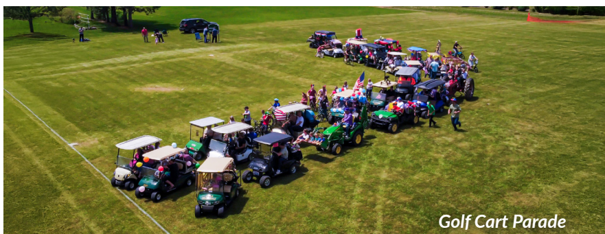
Golf Cart Parade