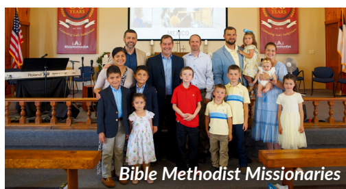
Bible Methodist Missionaries