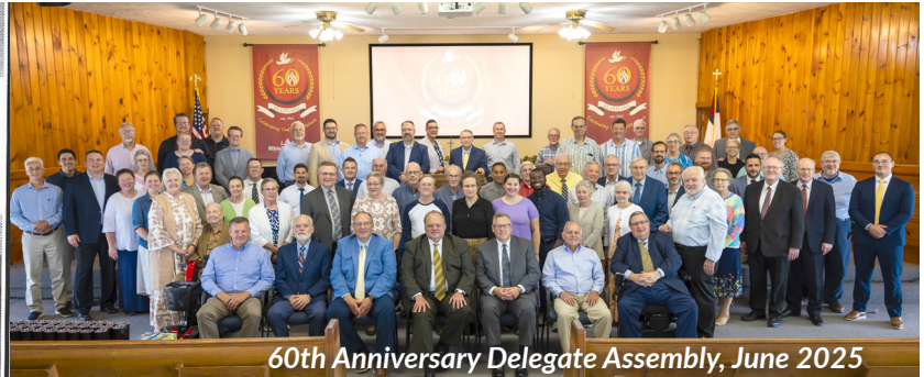
60th Anniversary Delegate Assembly, June 2025