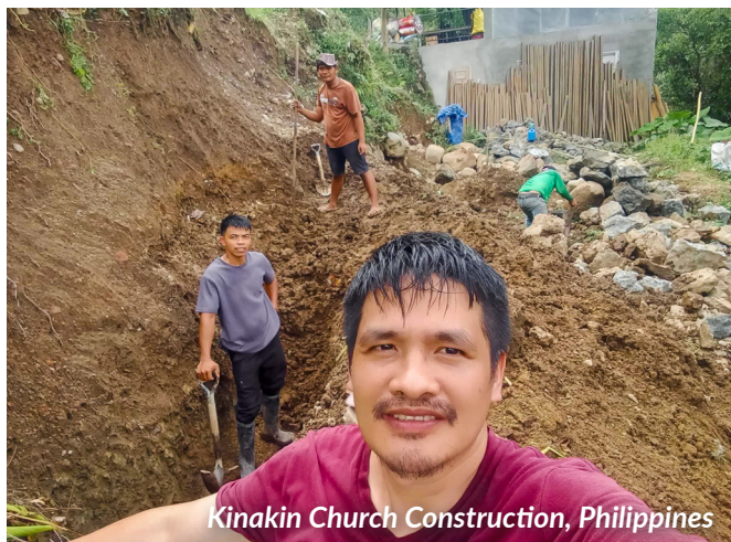
Kinakin Church Construction, Philippines

The Gospel Light conference also held a camp meeting in May. And several other conferences of the Philippine Bible Methodist Church held summer youth camps, as well as their annual conferences.